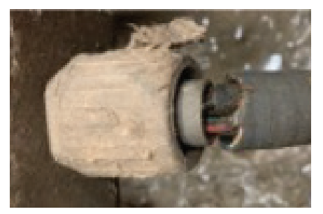
Connections in poor condition