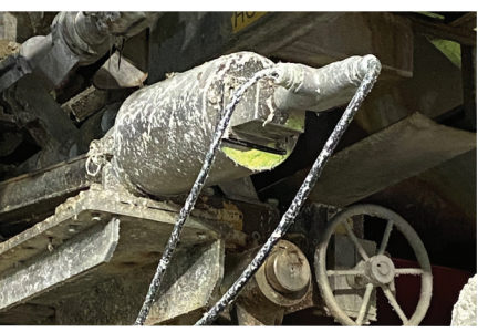
Oscillator not aligned properly