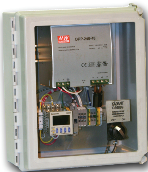
Optional power supply panel