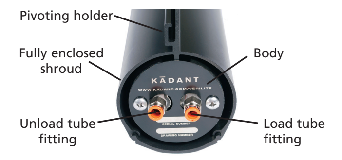
VeriLite X roll cleaner assembly shown is enclosed and used for harsh environments.

The patented VeriLite roll cleaner is designed to overcome the two reasons metal processors have not implemented continuous cleaning solutions on every roll: cost and complexity. These continuous cleaning systems are further enhanced by application-specific blade and pad materials as well as oscillators and roll traversing mechanisms.