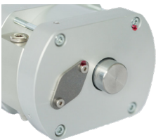
Varimatic 500 oscillator option.