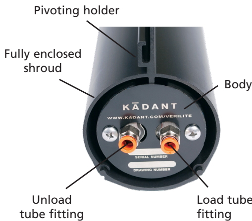
VeriLite X roll cleaner assembly shown is enclosed and used for harsh environments.

The patent pending VeriLite roll cleaner assembly provides a compact and unique scraper that offers excellent cleaning results to improve uptime and reduce maintenance costs in a variety of industrial roll and belt cleaning applications.